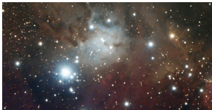
Fox Fur Nebula and NGC 2264 Region by Bryan Cogdell with EdgeHD 800

Astromaging is one of the most rewarding activities amateur astronomers can participate in. EdgeHD optics can produce results that were only attainable by professional level (and professionally priced!) equipment as little as a decade ago. Hundreds of thousands of amateur astronomers now spend their time under the night sky, capturing stunning images of the heavens above.