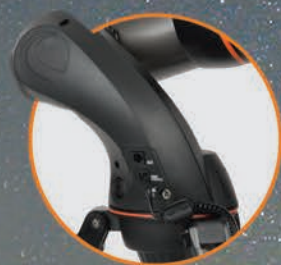
FULLY COMPUTERIZED alt-azimuth mount