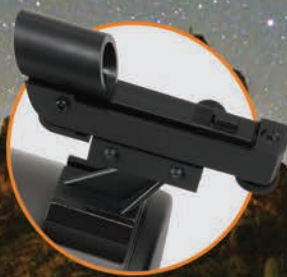
STARPOINTER FINDERSCOPE helps sight and center objects