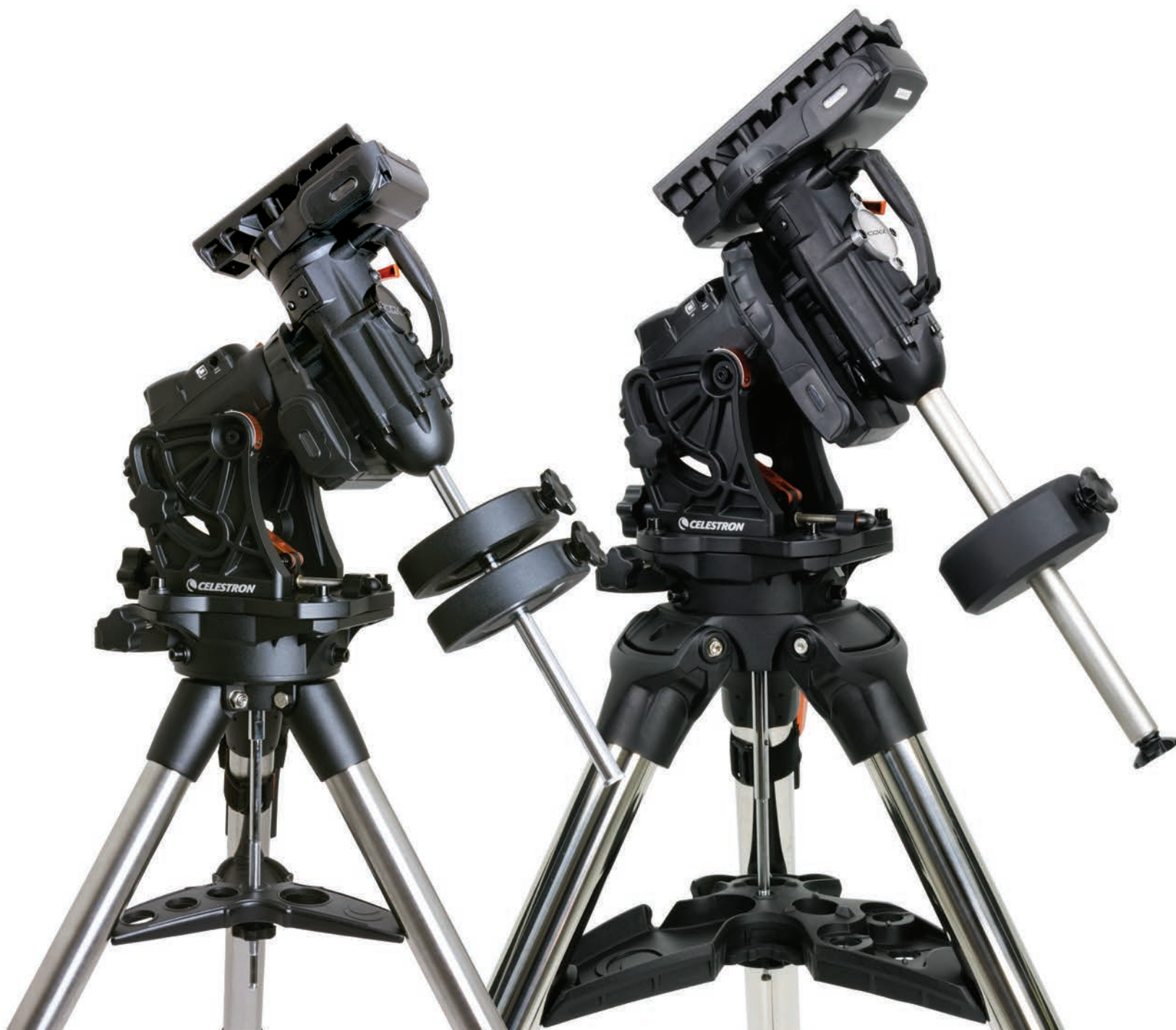
CGX Computerized Mount