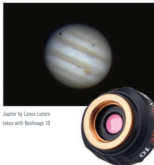
Jupiter by Lance Lucero taken with NexImage 10