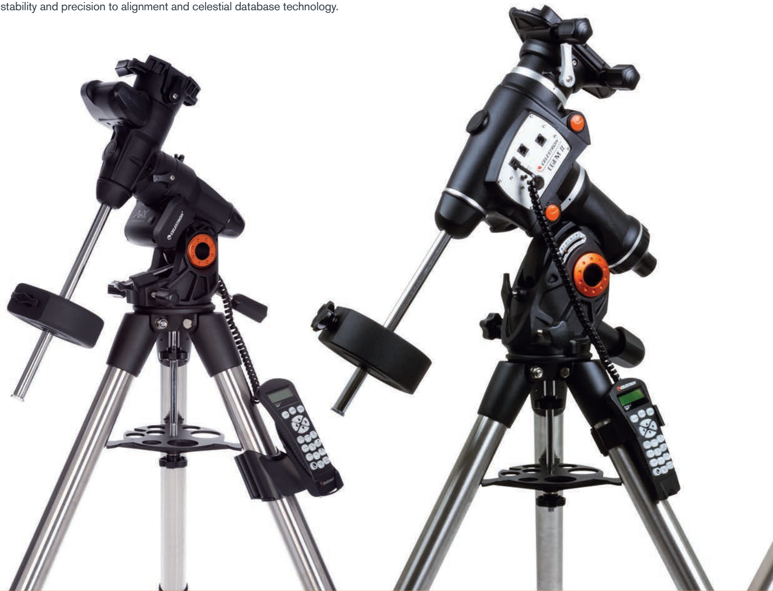
Advanced VX Mount

When assembling your ideal telescope, rely on Celestron's mounts as the perfect stable foundation. Each mount is ergonomically designed and optimized to accommodate your specific needs, from ease of setup, portability, stability and precision to alignment and celestial database technology.