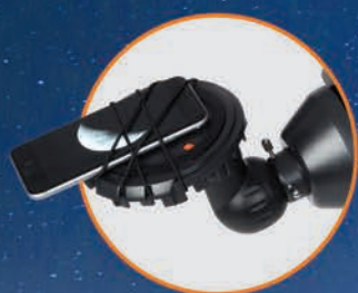
INTEGRATED SMARTPHONE ADAPTER perfect for the budding astrophotographer