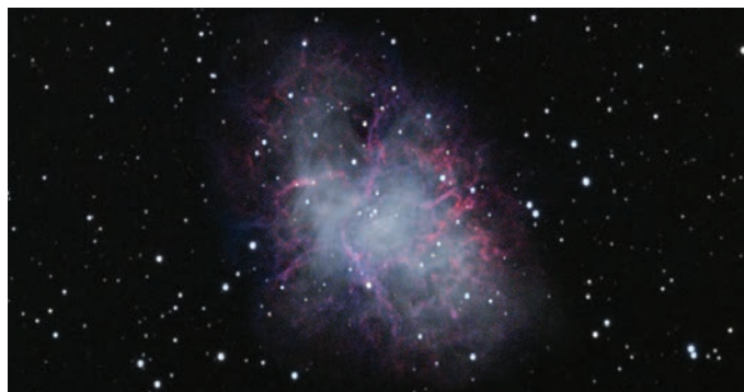
Crab Nebula by Andre Paquette with EdgeHD 1400

Learn more about EdgeHD Series by visiting celestron.com/edgehd