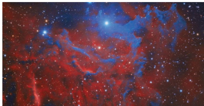
IC 405 Dancing Blue by Tony Hallas with EdgeHD 1100

Astromaging is one of the most rewarding activities amateur astronomers can participate in. EdgeHD optics can produce results that were only attainable by professional level (and professionally priced!) equipment as little as a decade ago. Hundreds of thousands of amateur astronomers now spend their time under the night sky, capturing stunning images of the heavens above.