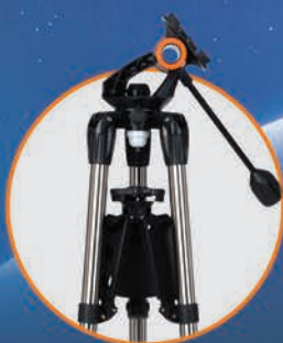
BUILT IN ACCESSORY TRAY easily folds up with tripod

Celestron is synonymous with inspired design and it is with that attitude that we have created our most feature-packed entry level telescope to date. Whether you favor portability and long focal length for high magnification of the Moon and planets or a wider aperture suited for brighter deep space objects; with three models to choose from, Inspire has something for everyone. Easy to transport and stow, Inspire telescopes feature the simplest setup of any telescope in its class.