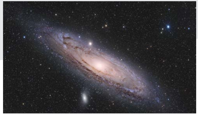
M31 Andromeda Galaxy